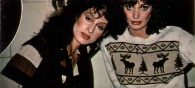
(r.) Nina Blackwood - later became an Mtv VJ