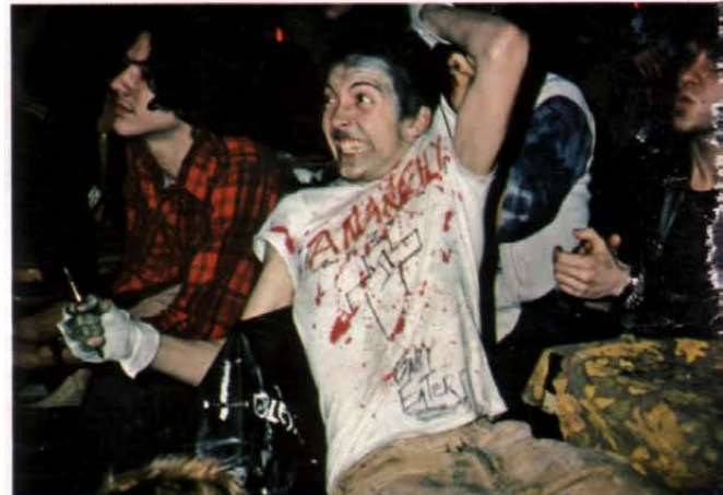
T-shirt says, "Anarchy Baby Eaters"