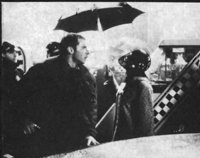
Deckard finds an umbrella can serve more purposes than shedding rain.