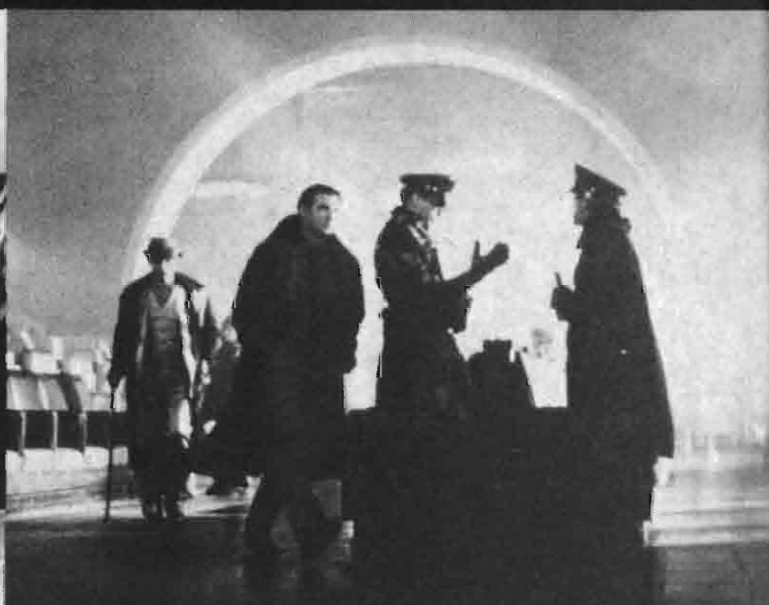
A glimpse of the futureworld of 40 years hence.