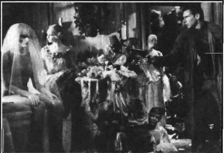
How do you get a bunch of dummies to put "Hands up!"?